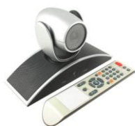
Model No. : WS-V720-10X