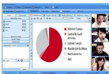
Model No. : WS-SF2014